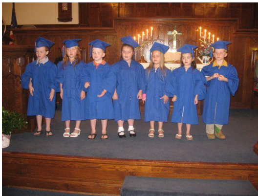
A few of the 2010 Preschool Graduates